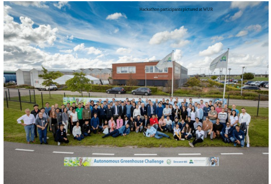
Hackathon participants pictured at WUR

Last year's competition, which focused on cucumber production, was won a team called Sonoma, consisting of Microsoft employees and students from WUR and the University of Copenhagen.