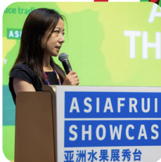
SHOWCASE STAGE SESSION

ON REQUEST... – BRING YOUR IDEAS AND WE WILL MAKE THEM A REALITY